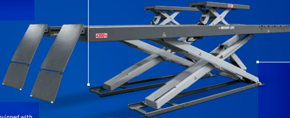
Image shows LTAK model, above ground with ramps

The control panel is equipped with a hydraulic unit pre-assembled at the factory and connected to the lifting platform. This hydraulic unit contributes significantly to reduced installation expenses. It can be placed on the left or the right.